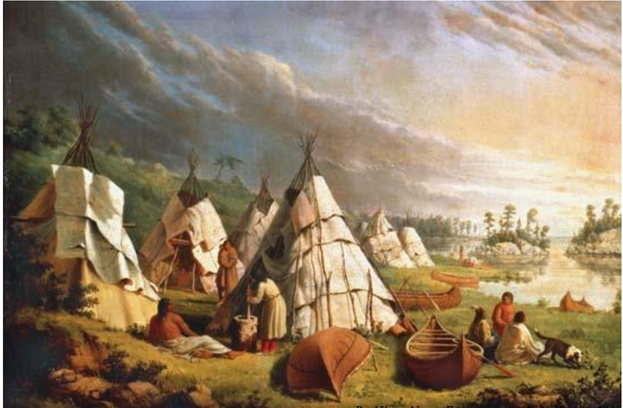
Paul Kane, Native Encampment on Lake Huron, c. 1845

CATALOGUE OF BOOKS, PAMPHLETS & EPHEMERA