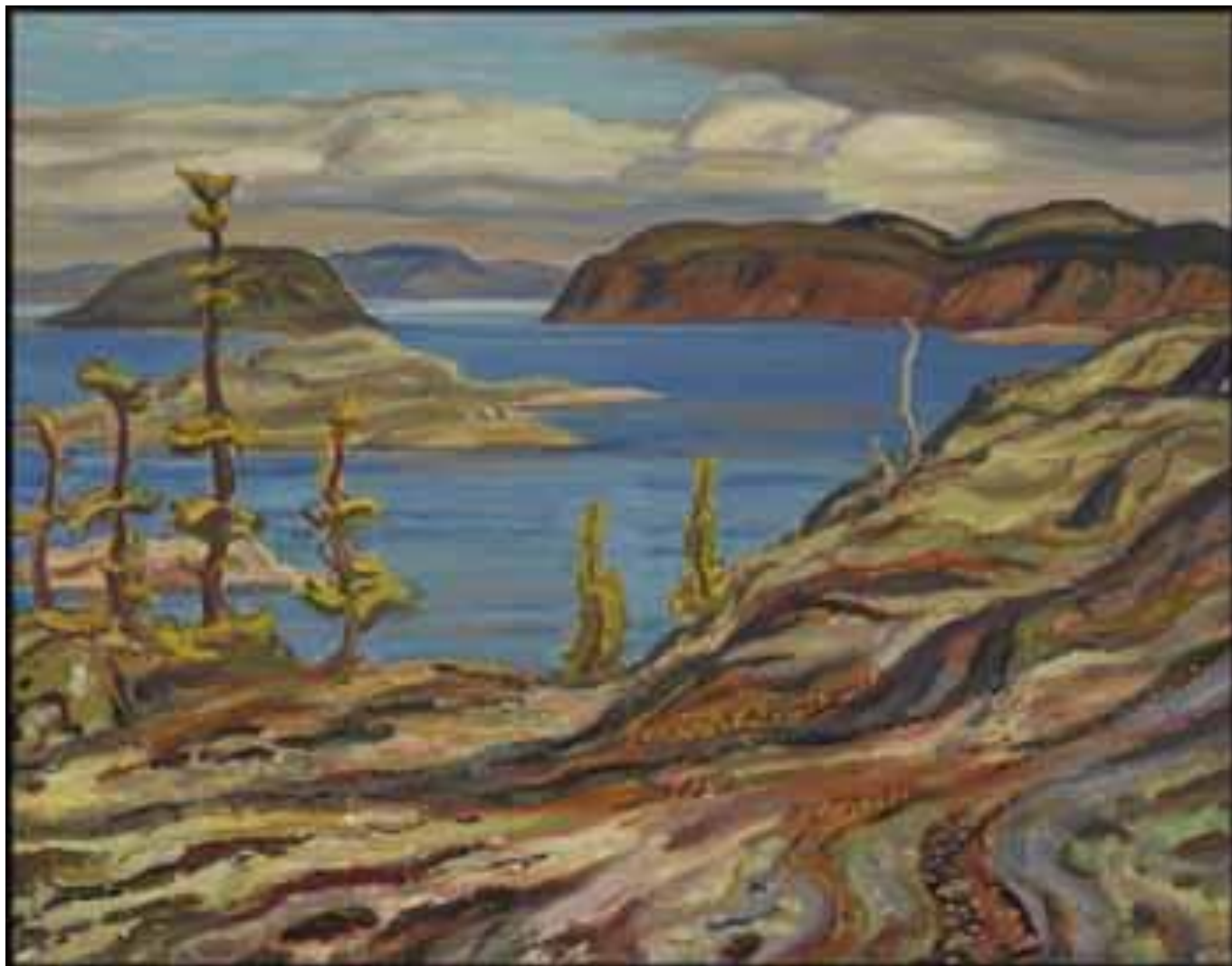
Great Bear Lake Near Port Radium, A.Y. Jackson (c.1949)